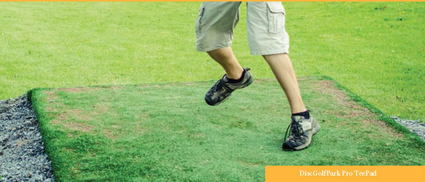
DiscGolfPark Pro TeePad